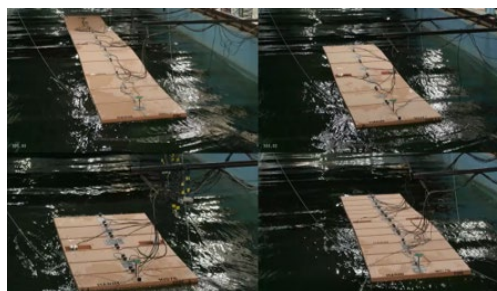
Concept Basin testing on the bamboo platform

This expertise and experience are combined in performing hydrodynamic studies for floating solar systems. Thereby, frequency domain and time-domain simulations, model tests and on-site measurements are carried out to gain insight into the limitations of innovative systems. We have previously collaborated with Merganser (Solar Duck), SeaVolt, Zon op Zee (Oceans of Energy), Solar@Sea (Bluewater), Zon op Water Field test at de Slufter, Submerged Solar (Sunfloat) and many more.