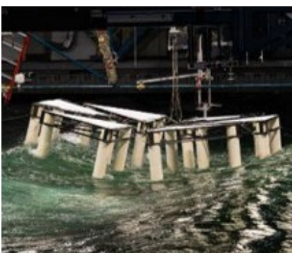
Offshore Basin testing on the Merganser platform

As the design progresses, MARIN offers more in-depth studies on motion and connector loads, including mooring analysis. This is achieved through improved load estimations using time-domain numerical simulations and Computational Fluid Dynamics (CFD). At this stage, early-stage basin testing can also be conducted to provide deeper insights into the motion behaviour in wind-driven waves.