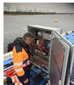
On-site measurements on FPV plant